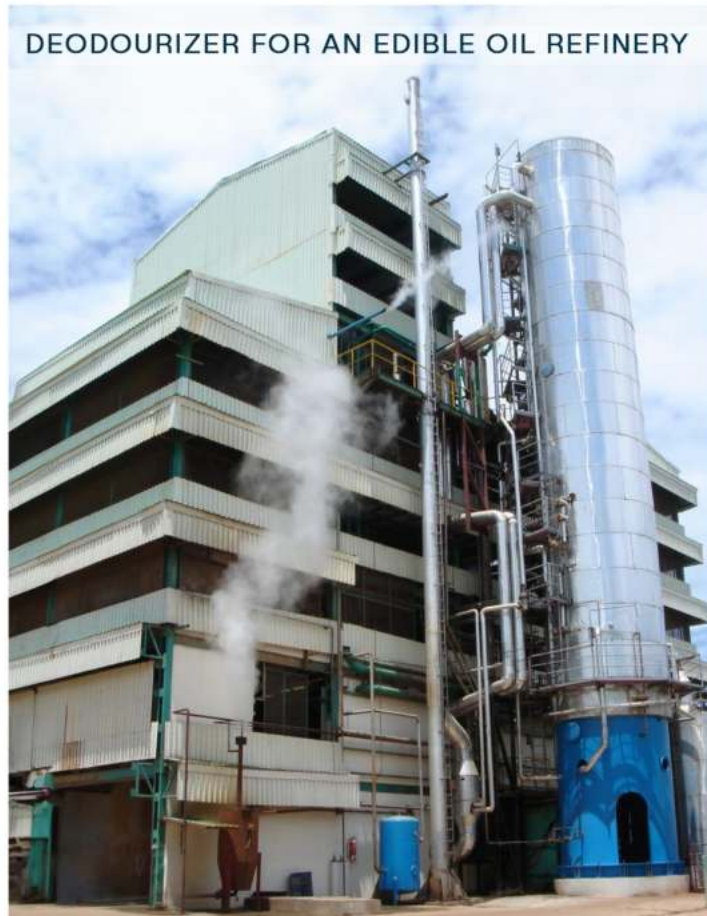
DEODOURIZER FOR AN EDIBLE OIL REFINERY