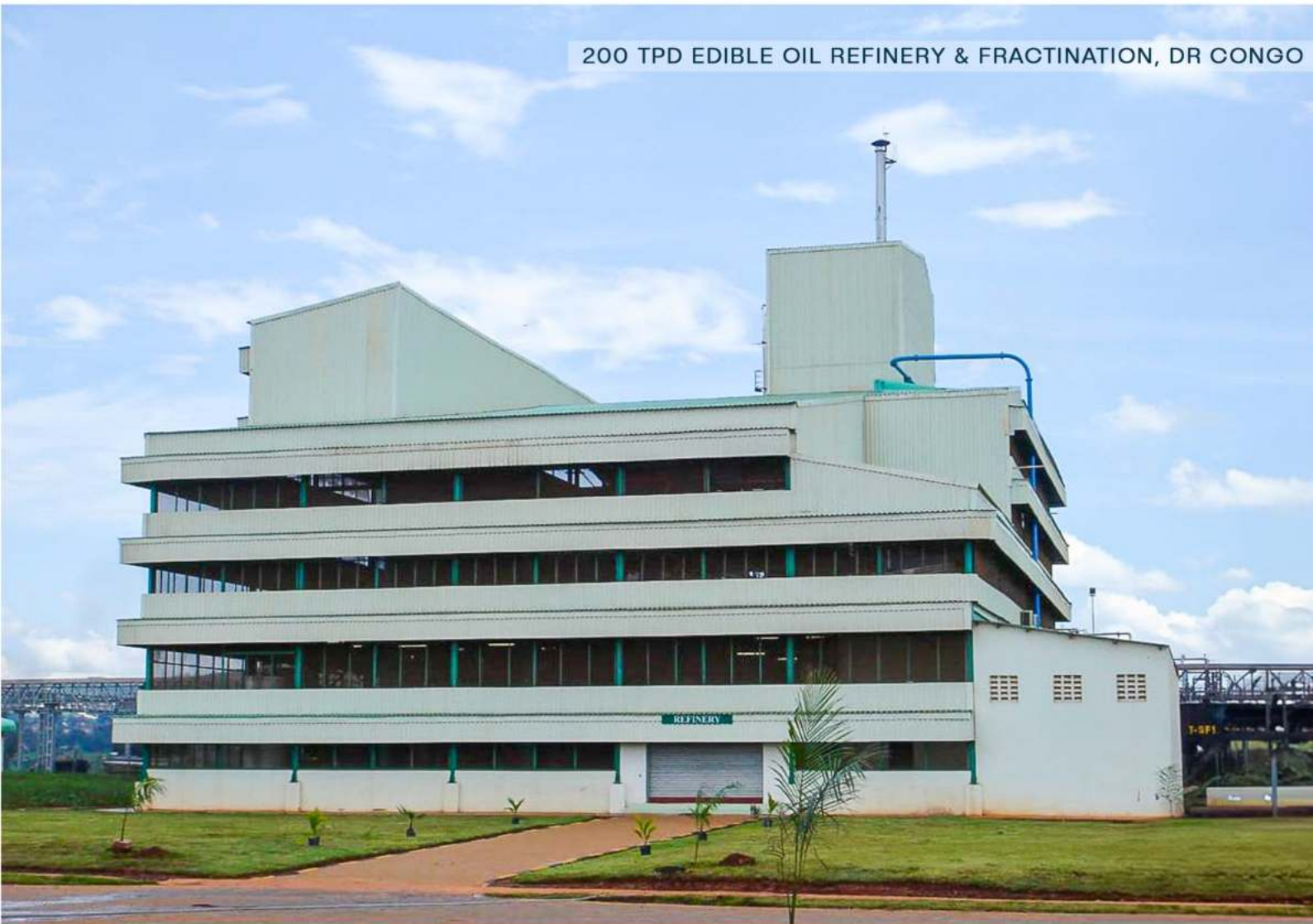
200 TPD EDIBLE OIL REFINERY & FRACTIONATION, DR CONGO

Our extensive network of offices, partners, and affiliates spans over 30+ countries, allowing us to deliver seamless and efficient solutions across borders and continents. This global presence ensures that we can mobilize resources and expertise quickly to meet the unique challenges and requirements of each project, regardless of location.