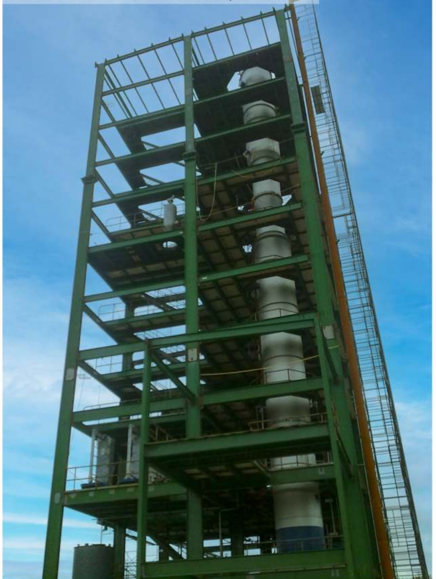
100 TPD EDIBLE OIL REFINERY, URUGUAY