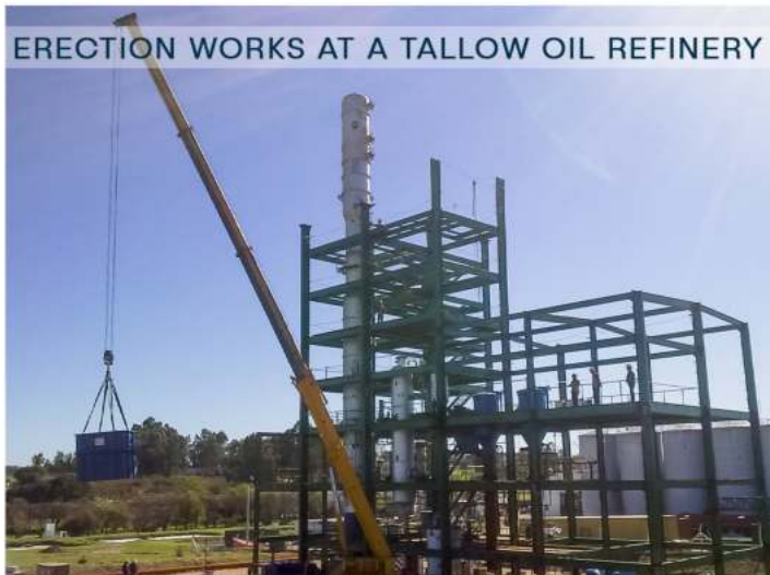
ERECTION WORKS AT A TALLOW OIL REFINERY