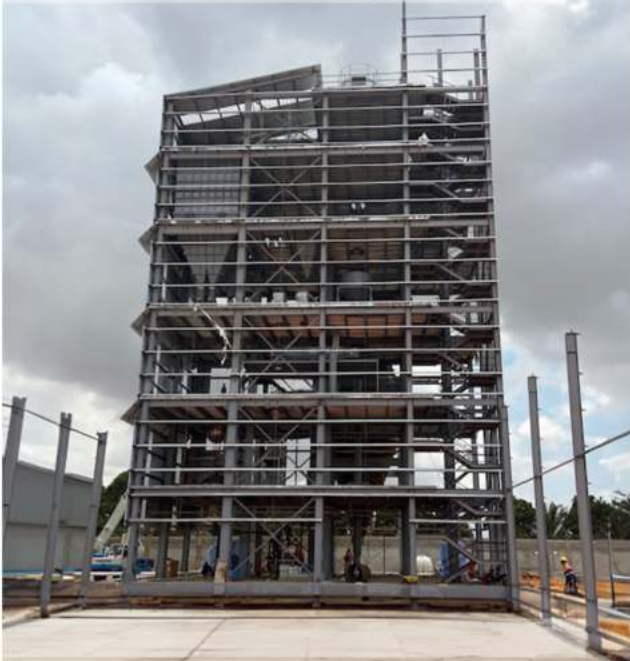
5 TPH DETERGENT PLANT, ANGOLA