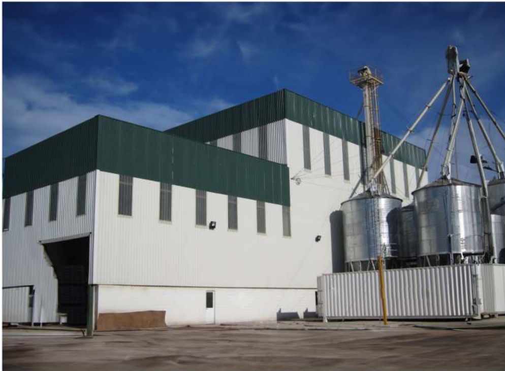
Pet Food Processing Plant, Uruguay