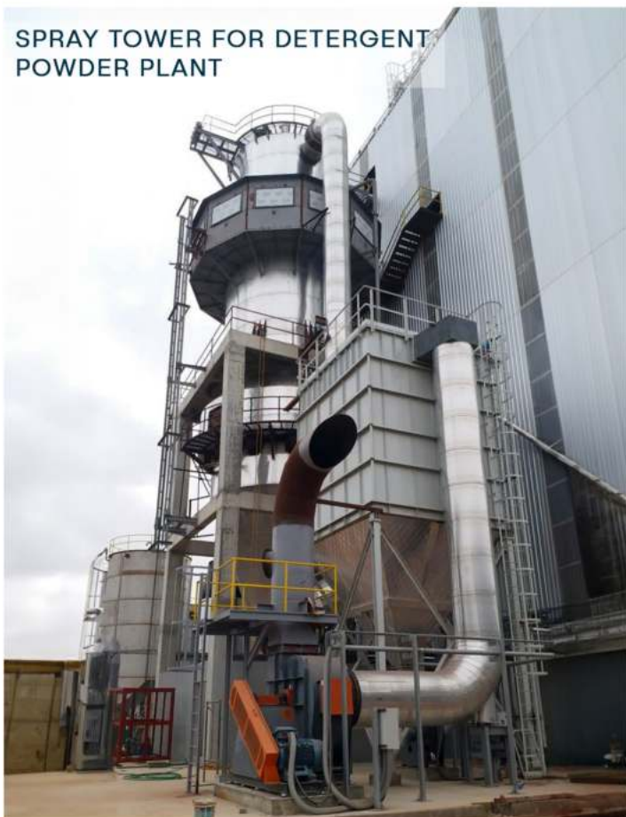
SPRAY TOWER FOR DETERGENT POWDER PLANT